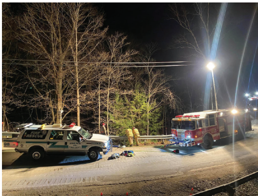
Low Angle Rope Rescue Joint Training

Several of our members have recently completed, or currently engaged, in training courses to supplement their knowledge and skills. We commend them for the extra commitment of time required and their ability to juggle work, family, and, of course, still respond to emergency calls. Please do not hesitate to encourage or thank them when you have the opportunity.