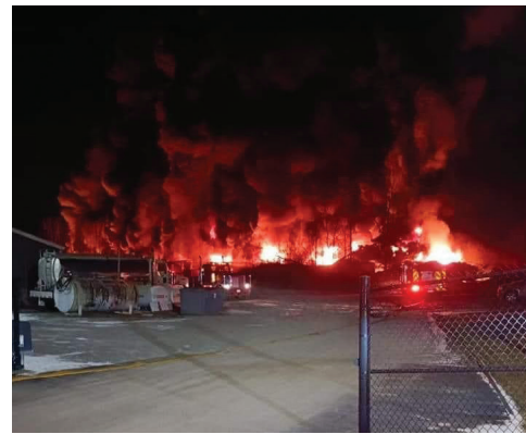
East Palestine Emergency Scene

If you have an interest in serving your community in the fire departments, please stop by and speak with our members. Both departments meet on Mondays at 6:30 pm, except for the second Monday of each month, which is reserved for our department business meetings.