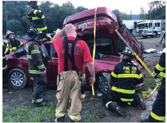
Vehicle Rescue Joint Training