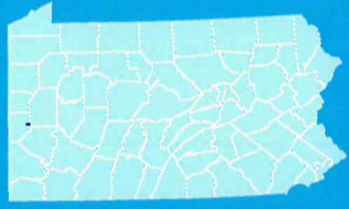
B25 WELL-CONNECT PIPELINE

B25 Well-Connect Pipeline, New Sewickley Township, Beaver County, PA